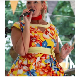
Retro Rita Play Time: Saturday 4th June 11.00 & 11.45