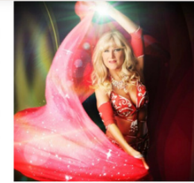
Jan's Gems Bellydancers Play Times: Saturday 4th June 12.30 & 14.45