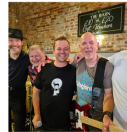
Downside Up Play Time: Saturday 4th June 17.15 - 19.30