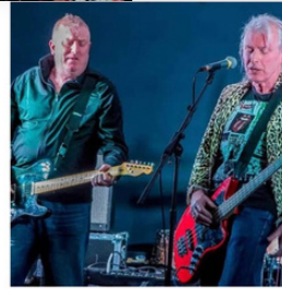
Spinout UK Play Time: Friday 3rd June 17.15 - 19.30