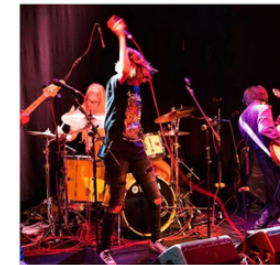
Bournemouth Academy of Modern Music Play Times: Sunday 5th June 11.00 & 11.45