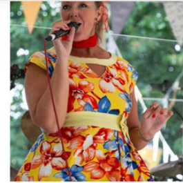
Retro Rita Play Time: Saturday 4th June 11.00 & 11.45