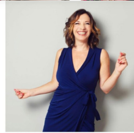
Bournemouth and Boscombe Light Opera Company Play Time: Saturday 4th June 14.00