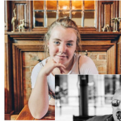
Grace Play Time: Friday 3rd June 11.00