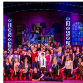
Bournemouth and Boscombe Light Opera Company Play Time: Saturday 4th June 14.00