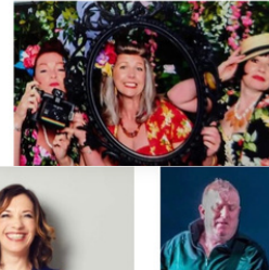
Spinout UK Play Time: Friday 3rd June 17.15 - 19.30