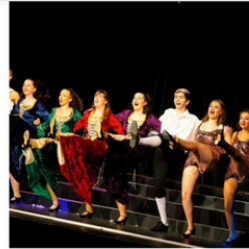
Encore Theatre Productions Play Times: Thursday 2nd June 12.30 and 14.00