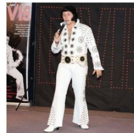
Downside Up Play Time: Saturday 4th June 17.15 - 19.30