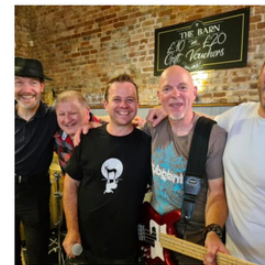
Bournemouth Academy of Modern Music Play Times: Sunday 5th June 11.00 & 11.45