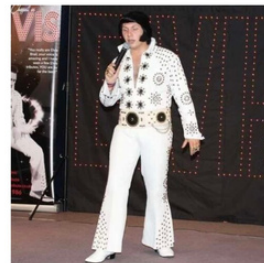
Downside Up Play Time: Saturday 4th June 17.15 - 19.30