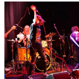
Bournemouth Academy of Modern Music Play Times: Sunday 5th June 11.00 & 11.45