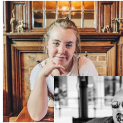
Grace Play Time: Friday 3rd June 12.30