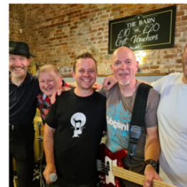
Downside Up Play Time: Saturday 4th June 17.15 - 19.30