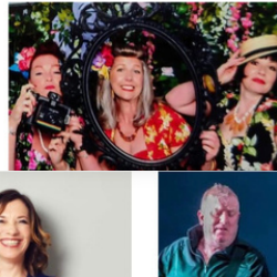
Spinout UK Play Time: Friday 3rd June 17.15 - 19.30