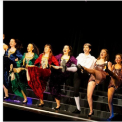
Encore Theatre Productions Play Times: Thursday 2nd June 12.30 and 14.00