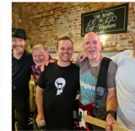
Downside Up Play Time: Saturday 4th June 17.15 - 19.30