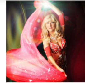
Jan's Gems Bellydancers Play Times: Saturday 4th June 12.30 & 14.45