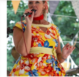
Retro Rita Play Time: Saturday 4th June 11.00 & 11.45