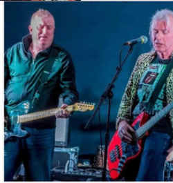
Spinout UK Play Time: Friday 3rd June 17.15 - 19.30