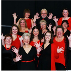
Wavelength A Capella Play Time: Friday 3rd June 11.00