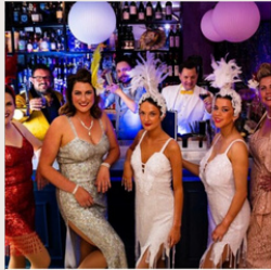
Highcliffe Charity Players Play Times: Thursday 2nd June 11.00 and 13.15

Our festival offers a diverse line-up of entertainment that appeals to all ages and tastes, including top local bands, music acts, drama groups, dance groups, and choirs. By becoming a sponsor, your brand will be front and center at the festival, reaching a captive audience of engaged attendees over the bank holiday weekend. Don't miss out on this opportunity to align your brand with the best in local entertainment and make a lasting impression on potential customers