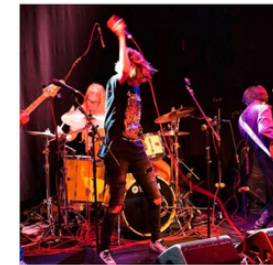
Bournemouth Academy of Modern Music Play Times: Sunday 5th June 11.00 & 11.45