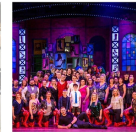
Bournemouth and Boscombe Light Opera Company Play Time: Saturday 4th June 14.00