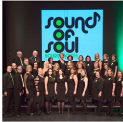
Sound Of Soul Play Time: Thursday 2nd June 11.45