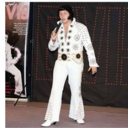
Downside Up Play Time: Saturday 4th June 17.15 - 19.30