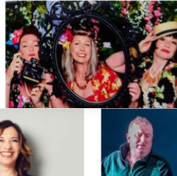
Spinout UK Play Time: Friday 3rd June 17.15 - 19.30