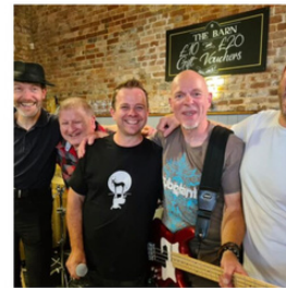
Downside Up Play Time: Saturday 4th June 17.15 - 19.30